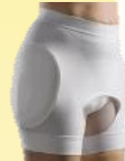
SafeHip Classic Open