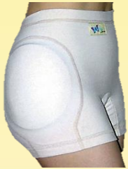
HipSaver Slim fit